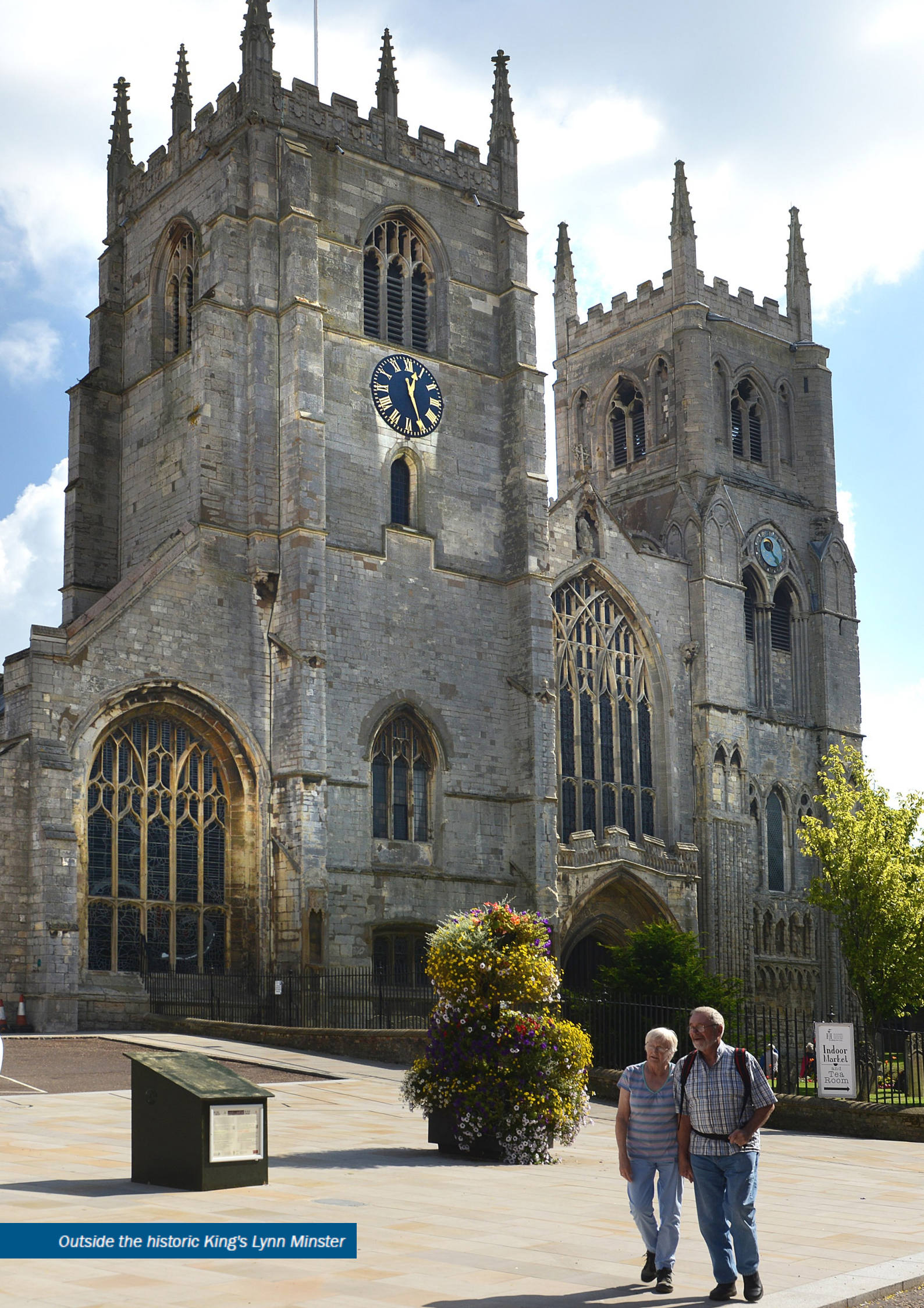
Outside the historic King's Lynn Minster