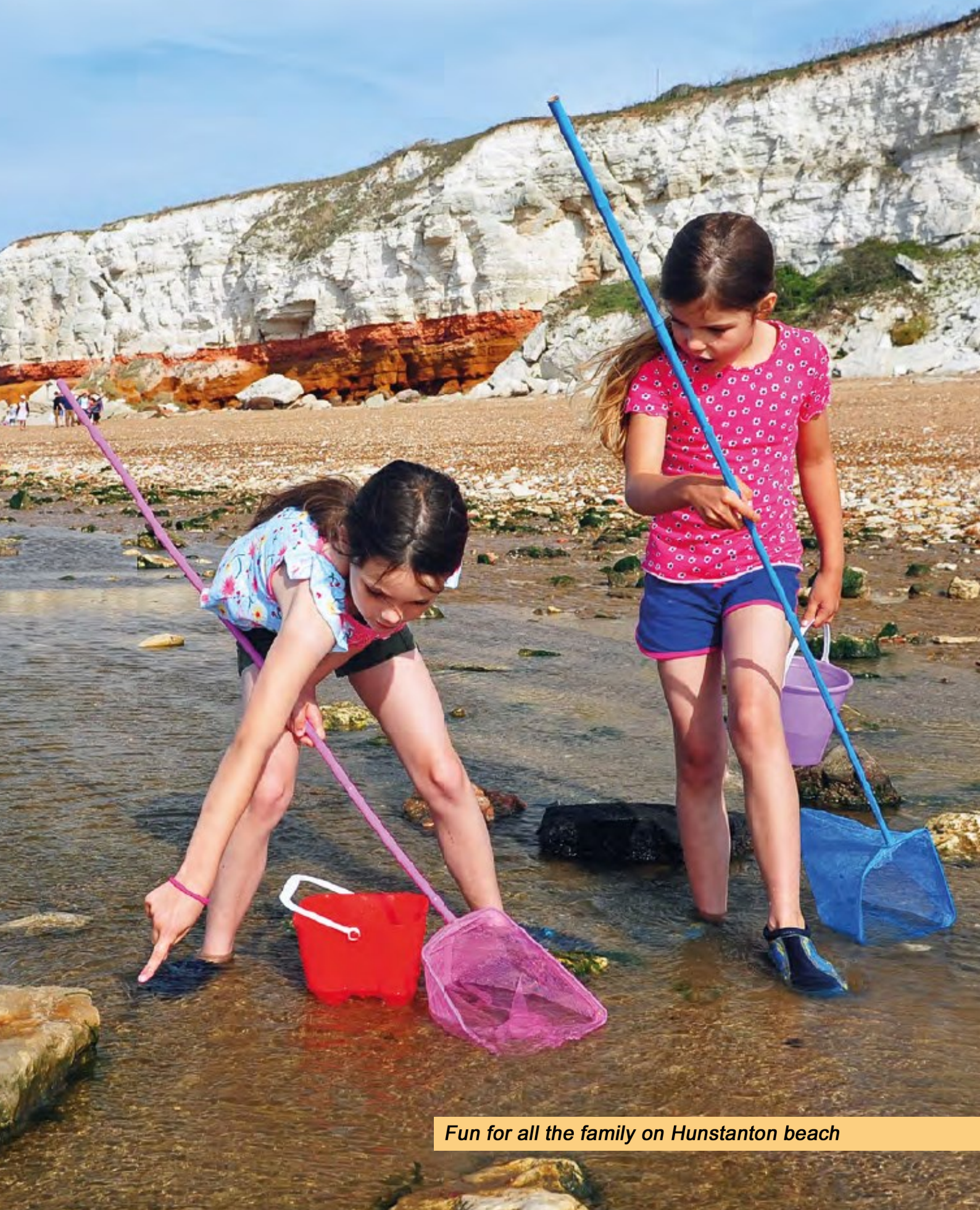
Fun for all the family on Hunstanton beach